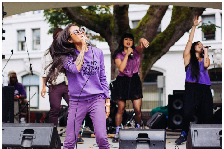
Purple Hearts Social Club

We live broadcasted the event with CiTR emcees hosting on-stage and interviewing bands during breaks.