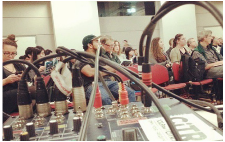
CiTR at Media Democracy Days 2015

Media Democracy Days: On Saturday, November 8th, CiTR did a live broadcast from the Vancouver Public Library's Central Branch to celebrate Media Democracy Days, where independent media is celebrated.