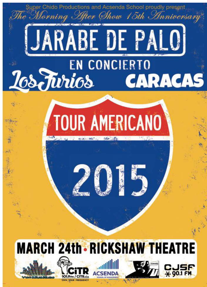
Poster for the Morning After Show 15th Year Anniversary Party