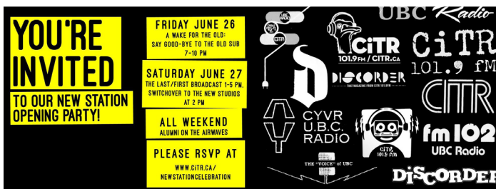
Images: invitation to station opening