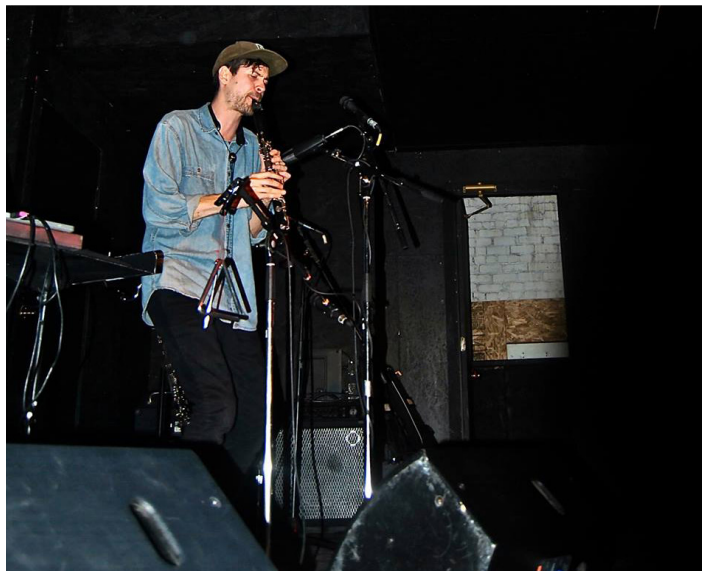
Skim Milk

S hindig 31: Last year was Shindig's thirtieth anniversary, and we celebrated the heritage of CiTR's battle of the bands; but 2014 threw some changes into the mix. Shindig 31 was our first year at The Hindenburg, 23 West Cordova Street. From this new space CiTR was able to accommodate a CiTR DJ every night, spinning music between bands. Shindig also shifted later in fall, starting in October with semi-finals and finals moved into January and February.