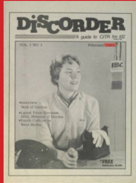
Image: First issue of Discorder, Published February 1983