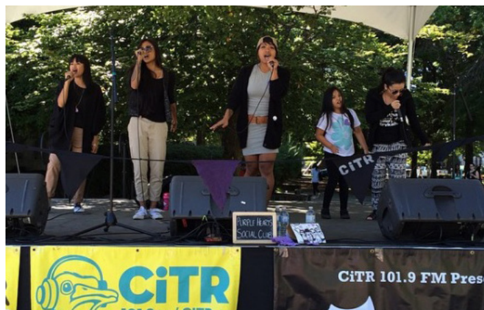
Purple Hearts Social Club performing at Live @ Lunch 2015