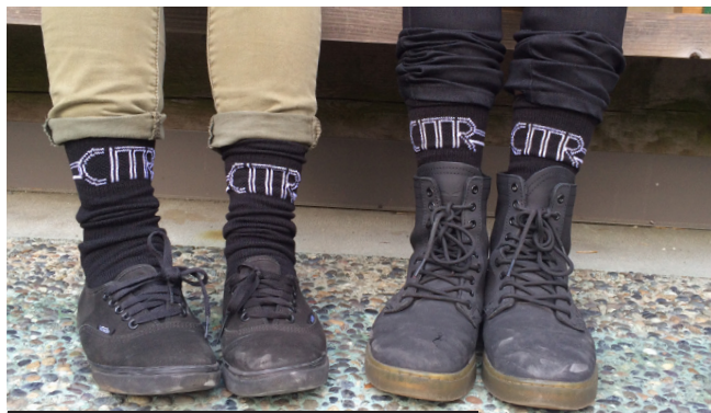
ONE OF THIS YEAR'S DONATION INCENTIVES - THE CITR RADSOCKS