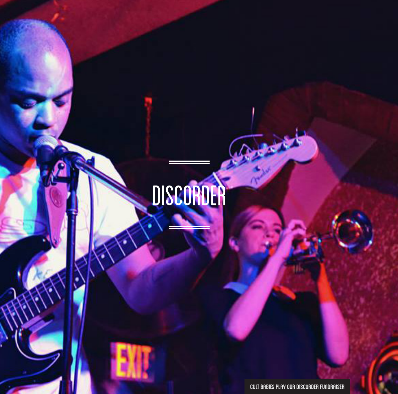
CULT BABIES PLAY OUR DISCORDER FUNDRAISER