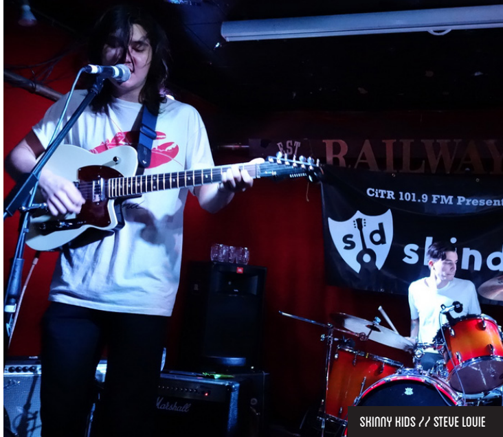
SHINNY KIDS