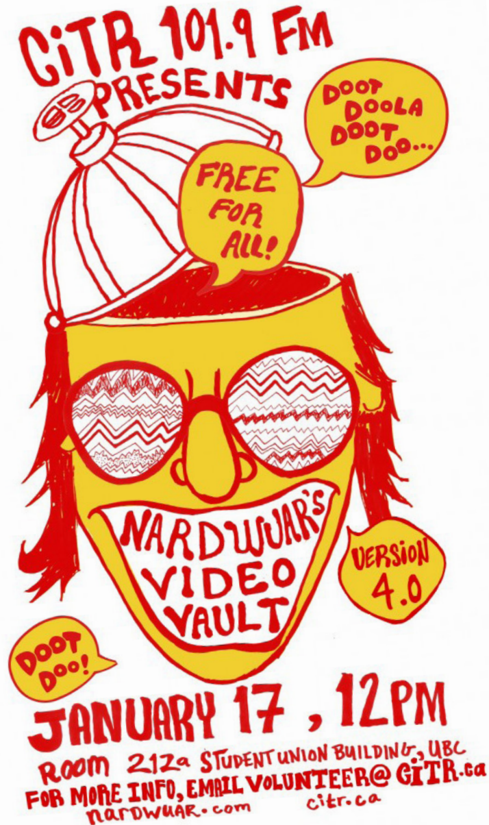
PAUL BUCCI DESIGN

Our tech staff continue to improve our online service, adding track listings to our website and online player.