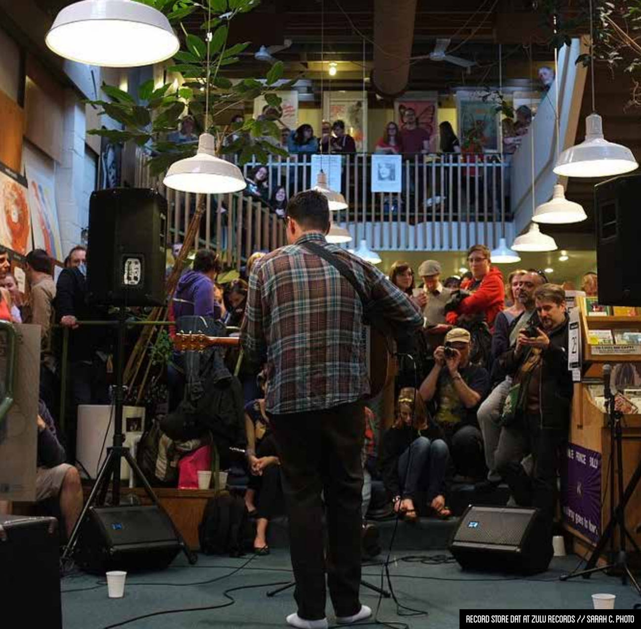
RECORD STORE DAT AT ZULU RECORDS