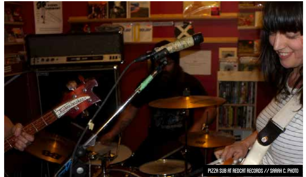
PIZZA SUB AT REDCAT RECORDS