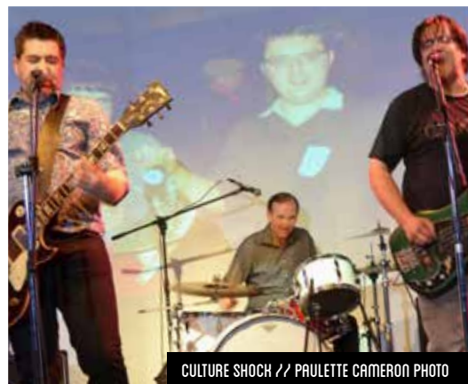
CULTURE SHOCK