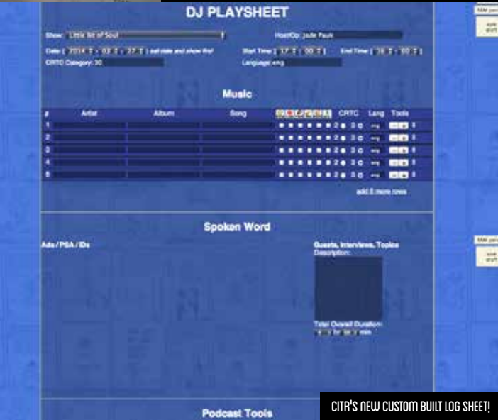
CiTR'S NEW CUSTOM BUILT LOG SHEET!

The Resonating Reconciliation project was created to help Campus and Community Radio share the stories of Indian